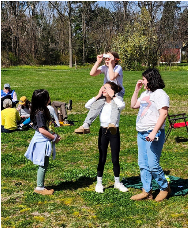
A junior patron offered a friend a lift up for a closer view of the eclipse