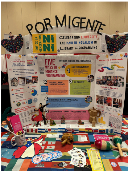
"Por Mi Gente" by Hoboken Public Library