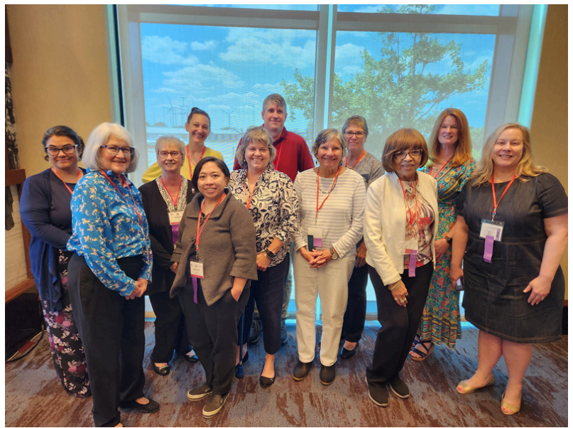
Past Presidents Luncheon

We look forward to a new year of NJLA and hope to see you all in 2025!