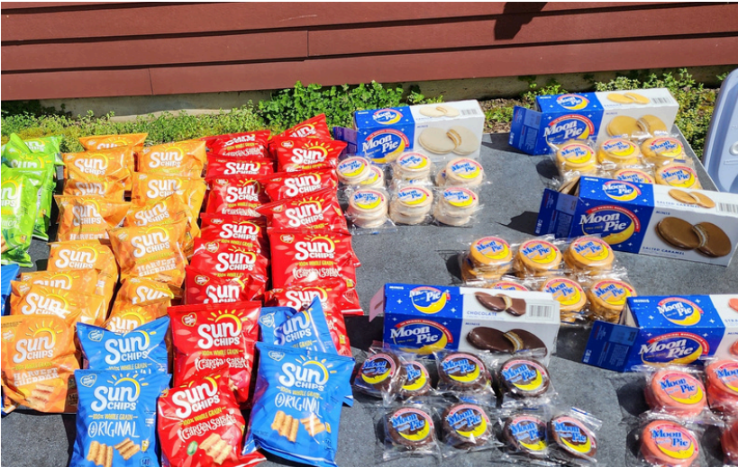
Party guests were able to enjoy celestial-themed snacks like Sun Chips and Moon Pies

happily munched on Moon Pies, Sun Chips, Capri Suns, and black and white cookies. The eclipse may not have reached totality here, but our party was a total success.