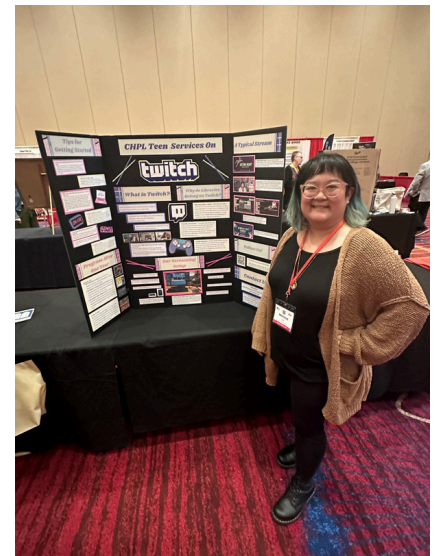
"CHPL Teen Services on Twitch" by Cherry Hill Public Library