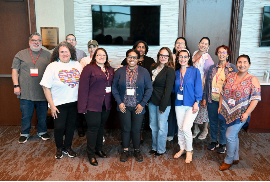
MentorNJ Latino Library Staff Meetup