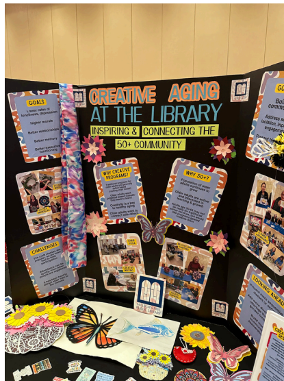
"Creative Aging at the Library" by Millburn Free Public Library